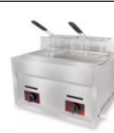
Quality Industries Tabletop LPG Double Fryer - Two 6L Tanks