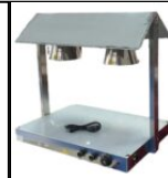
Quality Industries Double Head Food Warmer Light - 2x 375W, 110V, Free-Standing